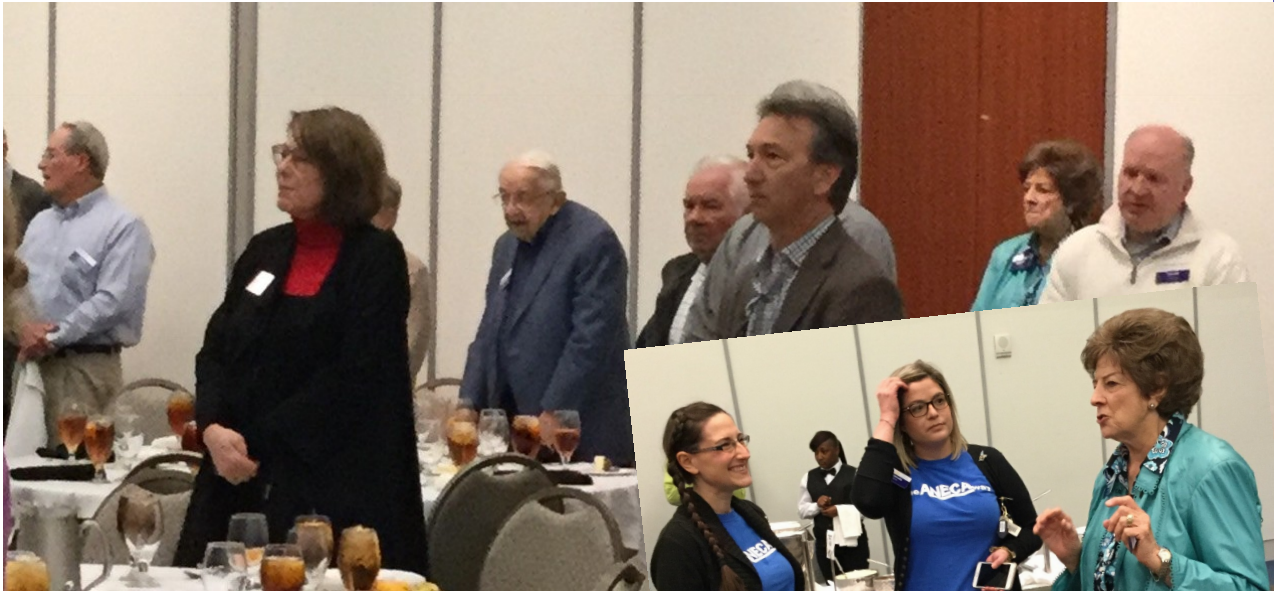
(Above) Some of our Rotarians standing to sing.