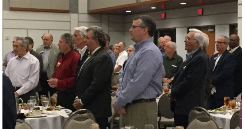
(Above) More members at lunch last Tuesday.